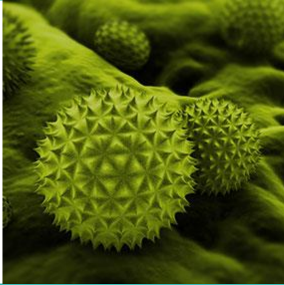
VARIOUS TYPES OF POLLEN